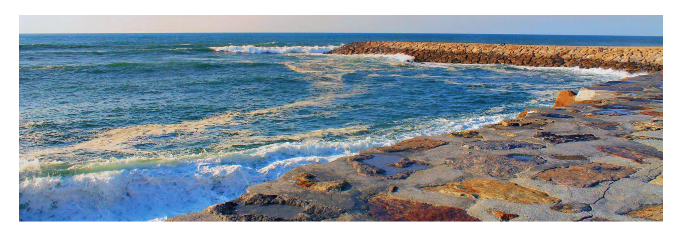
Day 3 - Furadouro to Lagoa de Mira

Today you will ride on a mix of roads and cycle paths to reach Torreira, then cycle on to the nature reserve of São Jacinto. Take the small "ferry" to cross the mouth of the Ria de Aveiro and arrive at the beautiful beaches of southern Aveiro. Potter along the bike paths and small roads, visit Costa Nova and its colorful fishermen's houses and then continue along the Ria to Mira Beach. Continue to the "Lagoa" (or lagoon) that borders the hotel where you will be staying. Dinner and overnight at Quinta Da Lagoa.