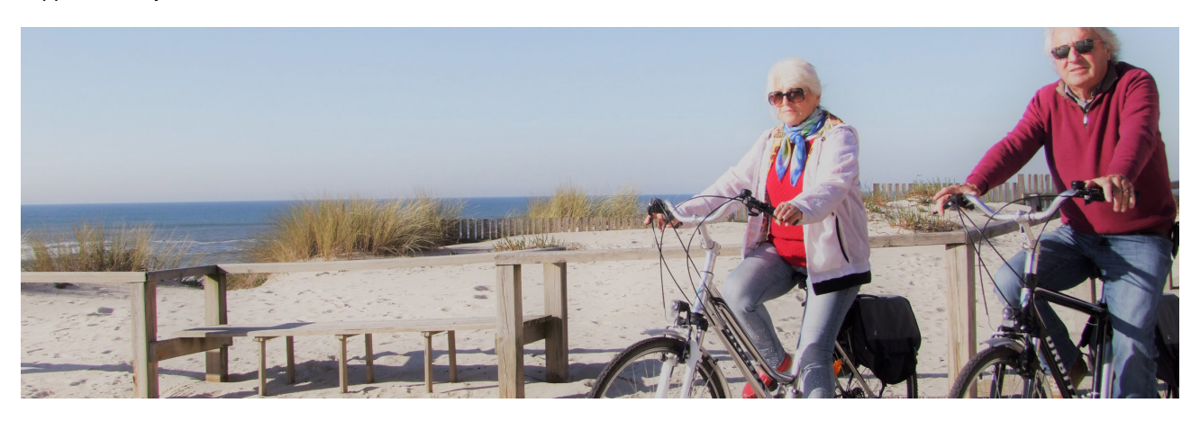
Day 4 - Lagoa de Mira to Serra da Boa Viagem

A beautiful day's ride surrounded by nature that is characteristic of this coastal region. Cycle amongst the pines and see the sand dunes, before climbing 280m to reach the nature reserve "Serra Da Boa Viagem", where you will cycle on small roads with magnificent panoramic views. Your hotel provides excellent views over the bay of Figueira Da Foz and is a wonderful place to relax in at the end of the day. Meal and night in Serra da Boa Viagem.