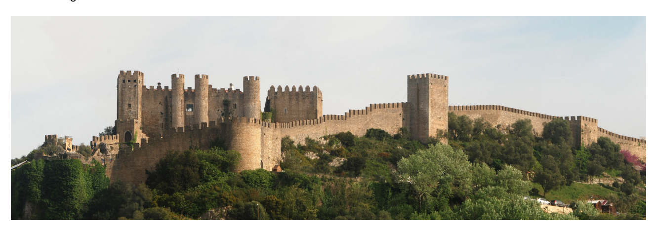
Day 8 - End of the trip

For those of you feeling brave, today's ride will take you to the Atlantic, south of the Obidos lagoon, before visiting the fortified city. The circuit is about 30km with some good downhill runs. Alternatively, a visit to Obidos, which is one of the finest examples of a Portuguese walled town. There are charming narrow cobbled streets, traditional painted houses and an imposing medieval castle. Hand back your bikes in the afternoon and be taken by van to the Quinta da Lagoa, Mira. Dinner and overnight in Mira.