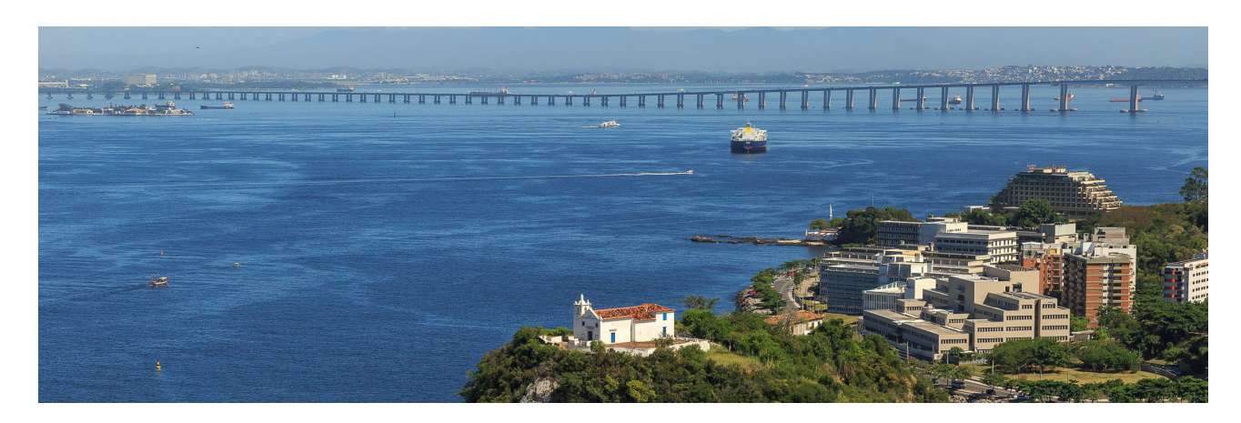
Day 5 - Serra Da Boa Viagem to São Pedro De Moel

A nice easy start to the day as you cycle down the winding roads that line the cliffs. The views extend out over the ocean, towards Figueira Da Foz. After crossing the bridge over the "Mondego" river (which is evoked in many Fado, the distinctive style of Portuguese singing), you will cycle along various roads and paths to reach the charming shell-shaped bay of São Pedro de Moel. Dinner and overnight in São Pedro de Moel.